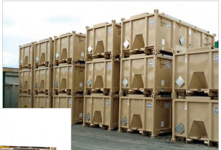
NAC LPT has the most modern fleet of IP-1 intermodal containers in the industry. NAC LPT offers clients more IP-1 intermodal container options, such as this specialized model for disposal (left photo).

We also provide trained radiological technicians and can augment your site staff with loading and shipping support.